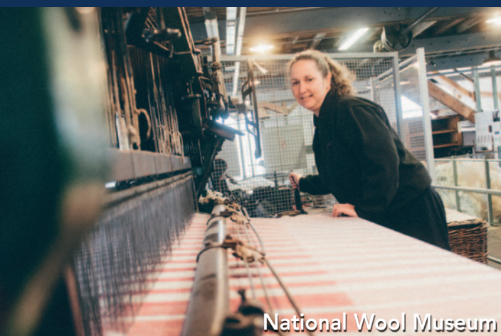
National Wool Museum