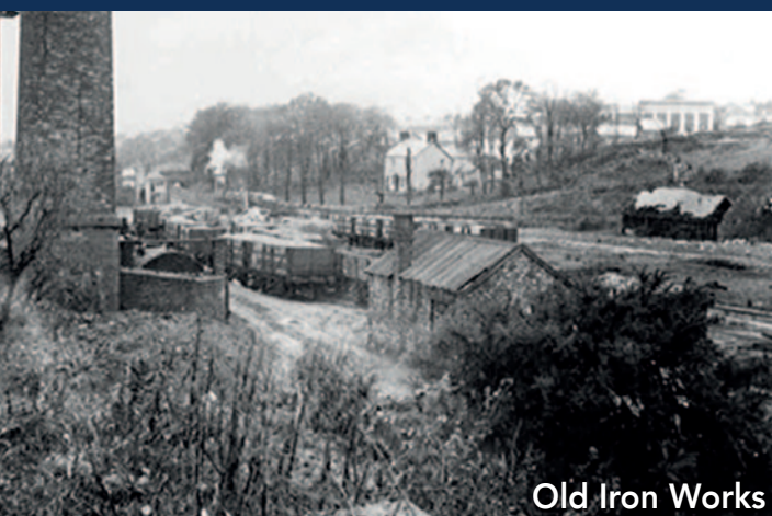
Old Iron Works