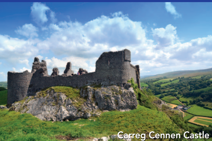
Carreg Cennen Castle