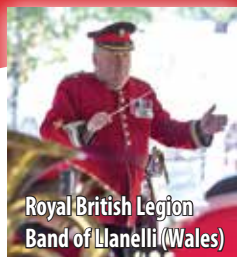
Royal British Legion Band of Llanelli (Wales)