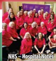
NHS – Hospital Notes