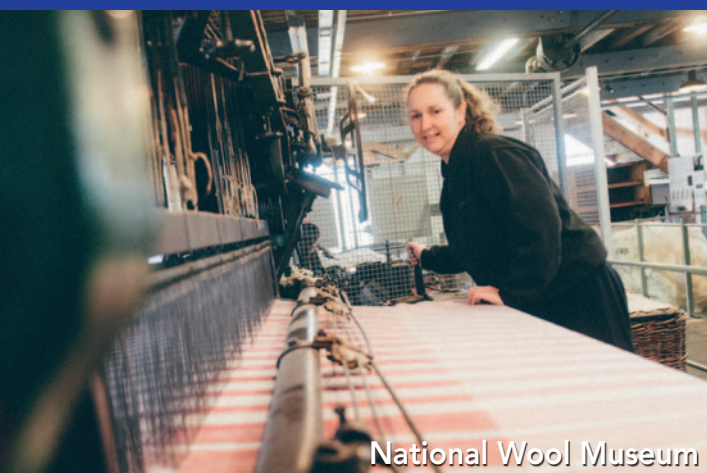
National Wool Museum