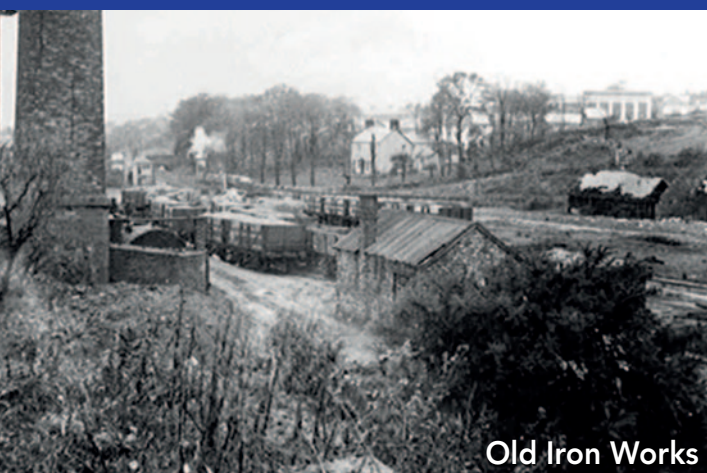
Old Iron Works